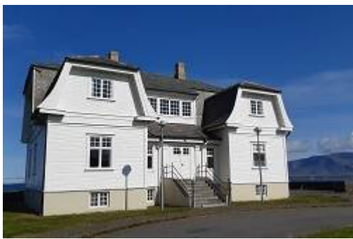
Villa Höfði (Reykjavík)

In this advisory report , which was published on 31 January 2019, the AIV argues that the increase in the number of nuclear-weapon states, the surge in nuclear modernisation programmes, the growing role of China and the availability of new technologies threaten to give rise to a new nuclear arms race. The 20th-century nuclear arms control treaties and deterrence concepts no longer suffice, and the AIV therefore calls for new talks between the nuclear powers.