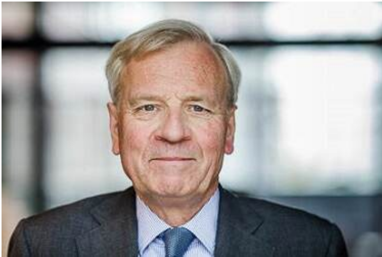
Professor Jaap de Hoop Scheffer, AIV Chair

Over the past year, the AIV put a lot of effort into raising awareness of its advisory reports and activities, including various innovations in the field of communication. The AIV has a new house style and a new website, which can be accessed at advisorycouncilinternationalaffairs.nl .